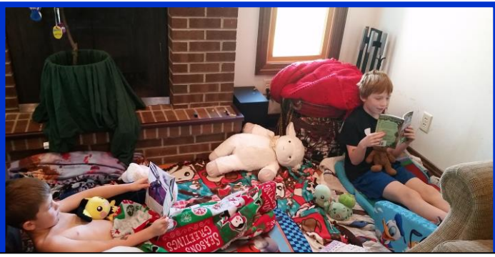
The Clark boys have recreated their classroom lofts.